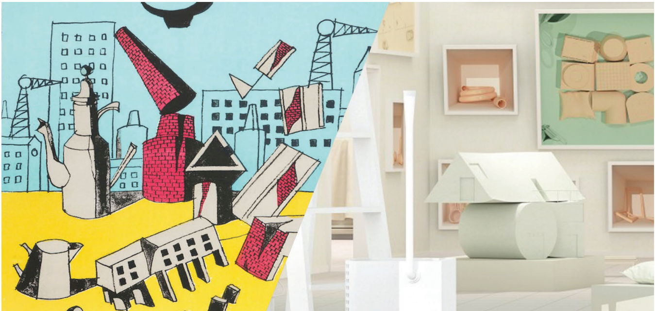
Figure 2. Aldo Rossi / NEMESTUDIO Both structures of association.

the individual pieces are ratcheted together into a single scene. This, a technique that Rossi employed in his noted 1976 entry to the Venice Biennale The Analogous City , has become unintentionally instructive in understanding the manner in which contemporary practices position themselves and their own work. As Pierluigi Nicolin once succinctly described: Both analogical and metaphorical meanings can, in this way, be ascribed to “ The Analogous City ” panel. That is to say, the work is open to a double, double reading. The panel is a montage composed of photo copies: fragments of urban plans (Como, the city of Vitruvius according to Gianbattista Caporai, in 1536), projects and drawings by Rossi himself (including a monumental coffee pot), Reichlin and Reinhart’s proposal for the Castle of Bellinzona, hillside and lakeside views, a Piranesian quotation, and a finger-pointing figure by Tanzio da Varallo, a 17th-century Lombardian painter. 3