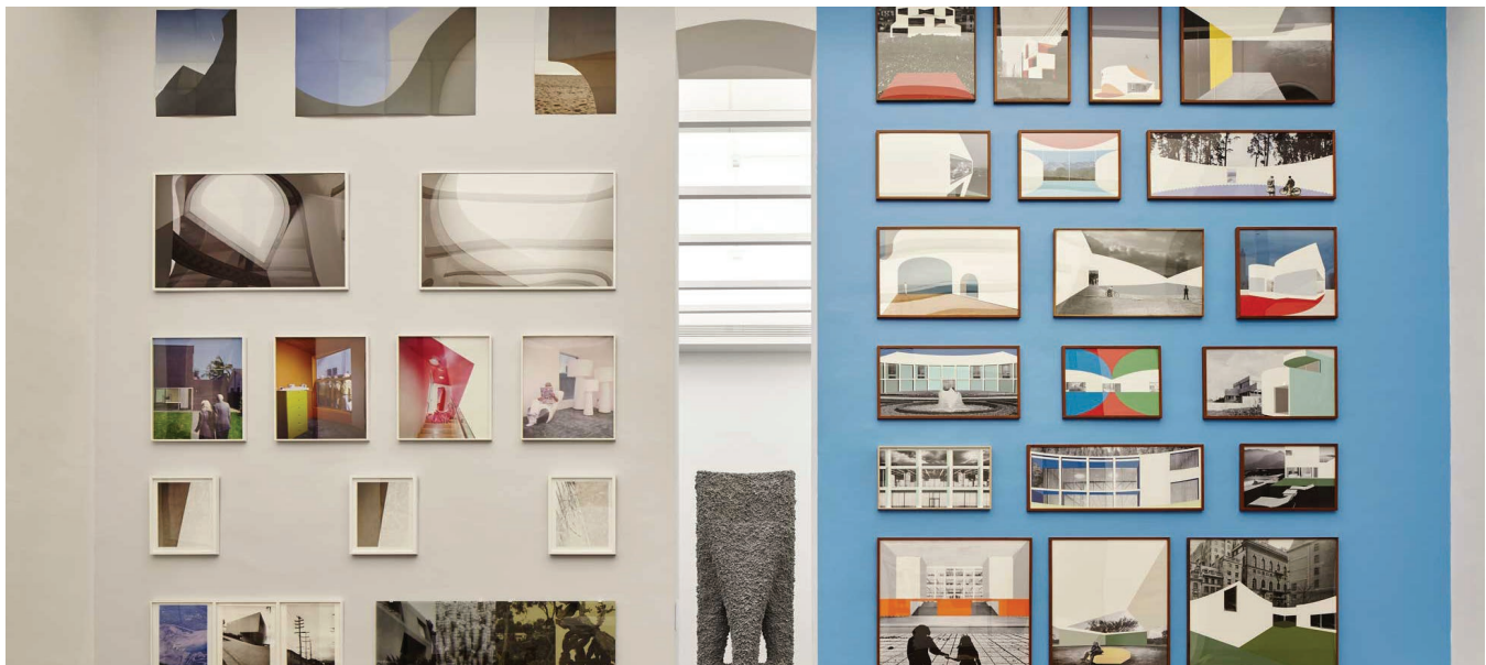
Figure 3. Johnston Marklee House Is a House Is a House is a House is a House.

Marklee for direct evidence of this search for signification. Johnston Marklee has established itself as an architectural firm engaged with contemporary art practices, drawing on artists, graphic designers, writers, and photographers to broaden the breadth of its research... In the early phases of a project, collage offers a way of drawing freely and quickly on diverse historical precedents, selecting key elements from existing architecture to establish a lineage with which the project will engage. 6