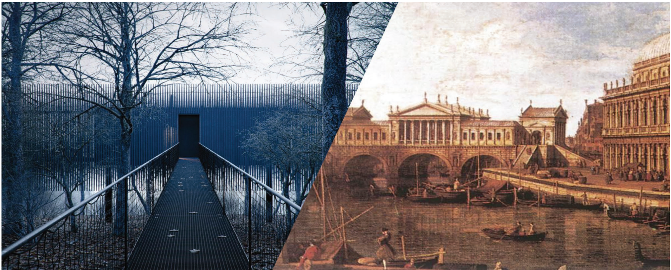
Figure 1. William O'Brien Jr / Canaletto Both forthright falsehoods.

captive audience. Images are created, edited, distributed, and circulated at an astounding rate, feeding a compulsive consumer culture of architectural imagery. By accepting that the image is no longer a bearer of intentional truth, the author and audience of a given image accept that they are viewing an alternate reality. Much like the audience of a magic show, we suspend disbelief and entertain a false reality in order to enjoy the experience.