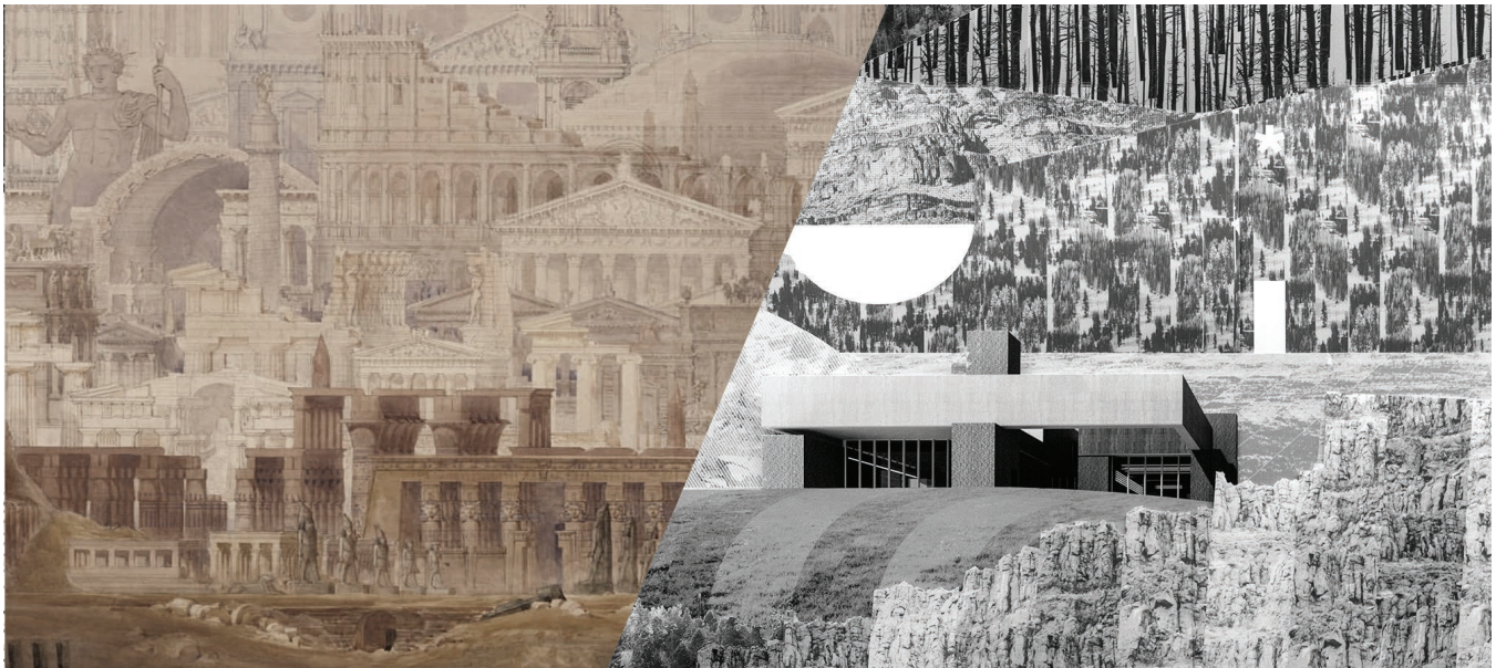
Figure 4. C.R. Cockerell / Kevin Hirth Both flattened adjacencies.

The effect is ultimately captivating more for its possibilities of adjacency and contradiction than as a visual catalogue of architecture. Cockerell has created an urban scene that foretells the sort of competitive monumental urbanity that the twenty-first century confronts as a normative condition, with layers of overlapping monumental buildings creating vertiginous negative space in between. The rendering of the individual buildings as a field of self-similar objects likewise introduces Cockerell as the editing author of all that is seen as his own. Because he has drawn them as a single overlapping composition, the observer easily reads the entire composition as a uniform monolithic construct. The result is an analogous image that approaches absurdity when divorced from its indexicality. As Cockerell's biographer, David Watkin once wrote: This strange romance, these pyramids, porticoes, and domes, is surely the idea, years before its time, of Banister Fletcher's celebrated History of Architecture on the Comparative Method . One can only envy Cockerell for having lived before the invention of stylistic labels by architectural historians. Thus, unhampered by considerations of whether a particular building was 'Baroque' or 'Neo-Classical' he could dart from one period, place or person to another. 8